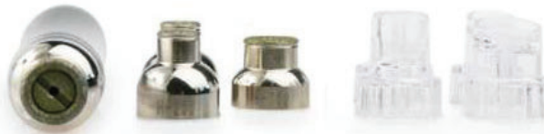
Gentle Exfoliation Ruffle Tips Clear Extraction Tips

The Clear Extraction Tips have smooth edges and transparency that allows fluid gliding over the opened skin pores and pain-free deep extractions of sebum from pores. After this step skin became visually cleaner and brighter with the effect of "empty" pores.